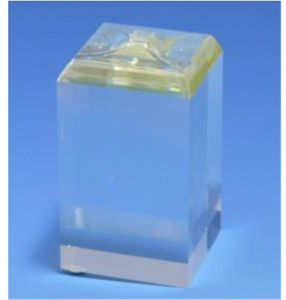
KTN Single Crystal